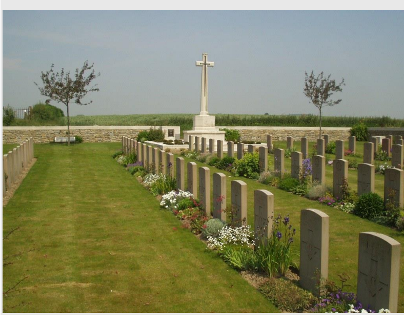
Buried in a farming area along with his Scottish mates