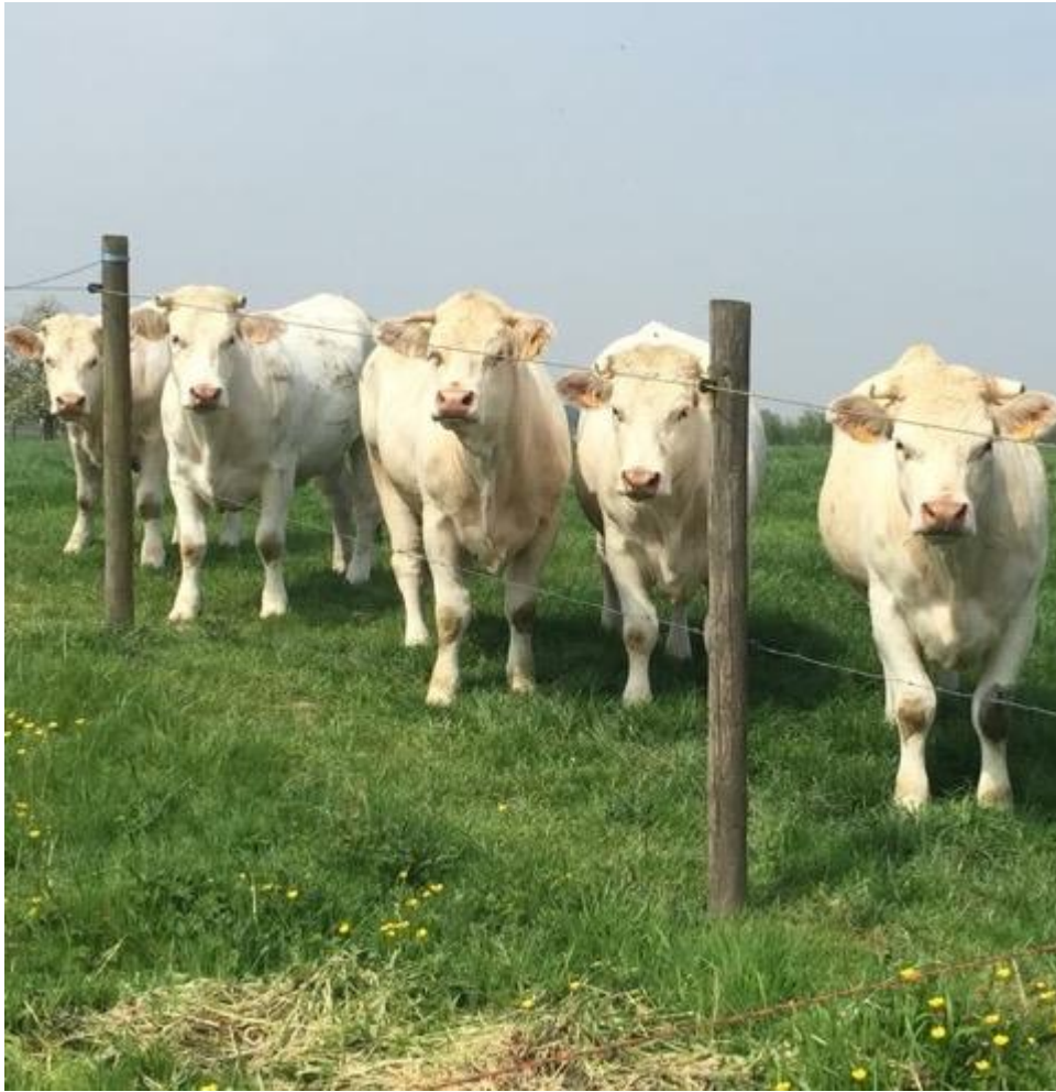
Buried near a farmyard .