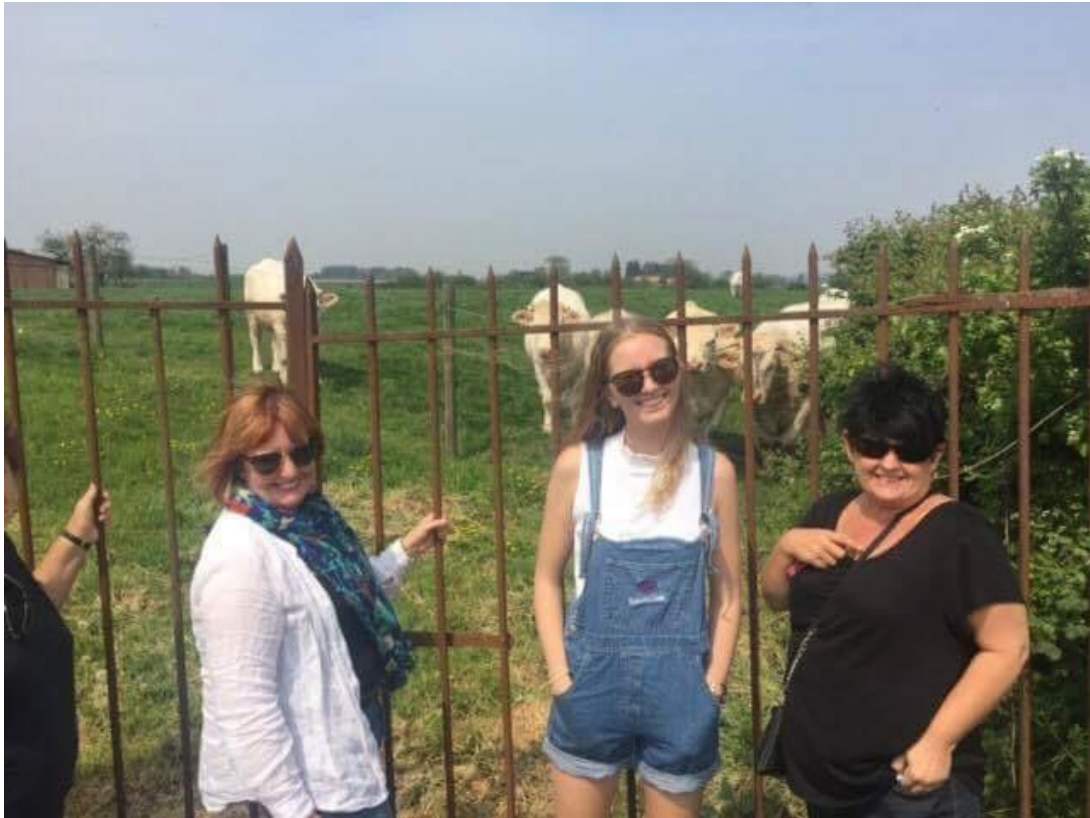
Relatives remember nearly 100 years later.